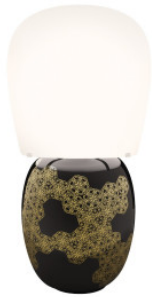
Table lamp Hive by Kundalini with shade of two-layers opaline glass and body of enameled ceramics, decorated with the "three-phase-firing" method. Diffuse ambient light. For E27 lamps. With switch on the cable.