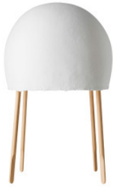
Table lamp Foscarini Kurage with shade of Washi paper and four small legs of ash wood. Diffuse illumination. Cable is coated with nature-coloured paper fibers. For E27 lamps. With switch on the cable.