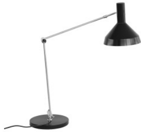
Table lamp Baltensweiler Type 60 made of aluminum with chromed structure, head and base anodized. With switch on the lamp head. For E27 bulbs.